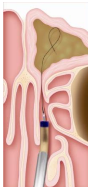
Step 1 Introduction of guidewire into the sinus

Sinusitis accounts for more than 20 million office visits per year. Direct healthcare expenditures due to sinusitis are estimated to be more than 8 billion dollars each year. Standard medical management has evolved from use of simply an antibiotic, to the addition of medications that can aid in the resolution by reducing inflammation and easing sinus outflow (such as nasal steroids, mucolytics, saline irrigations). In many patients, optimizing allergy management with immunotherapy can greatly reduce symptoms of sinusitis. However, despite optimal medical and allergy management, about 20% of chronic sinus sufferers will continue to be significantly symptomatic with adverse effects on quality of life. Over the last 20 years Endoscopic Sinus Surgery has evolved to be less invasive, safer, and less painful; clinical relief has improved significantly with dramatic reduction in morbidity. Most patients generally require one week off of work, and removal of tissue with this technique poses risk of scar formation. For many patients, a new, minimally invasive approach, Balloon Sinuplasty, could provide great relief with minimal risk and minimal morbidity.